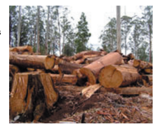
Logging coupe in Goongerah forest ing, for water, tourism and threatened species habitat.

Most forest in East Gippsland is used for export woodchipping. The Goongerah forest in particular has little sawlog value. These forests have a greater value left stand-