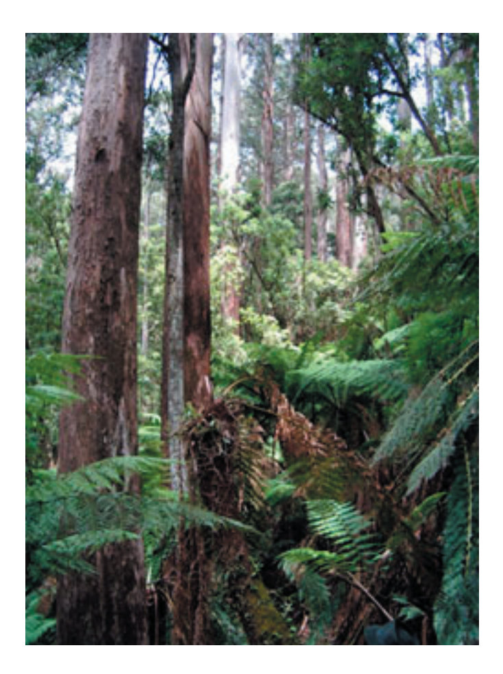
Yalmy and Goongerah Forest